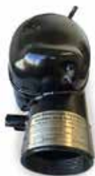
1/20 hp to 1 hp