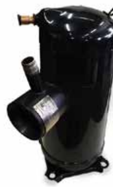
10 hp to 25 hp

ANDOVER PROTECTION SYSTEMS MANUFACTURES THE ONLY LINE OF HERMETIC REFRIGERATION COMPRESSORS EXPRESSLY TESTED AND APPROVED FOR USE IN HAZARDOUS AREAS REQUIRING EXPLOSION-PROOF OR FLAMEPROOF EQUIPMENT.