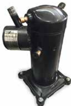
1 hp to 10 hp